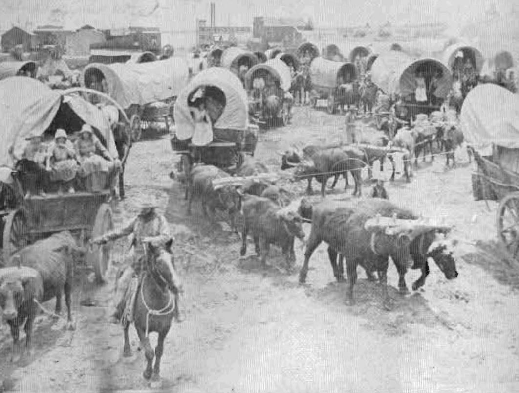
A typical scene on the banks of the Arkansas at Great Bend as the pioneers made their new trails into the unknown West.

photo books of pioneer westward travel on the river and the trail