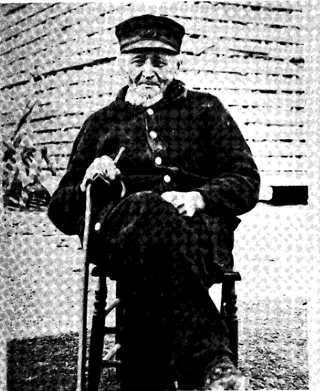
One of the early Hollanders who settled in Kansas. This photo was taken around 1913.