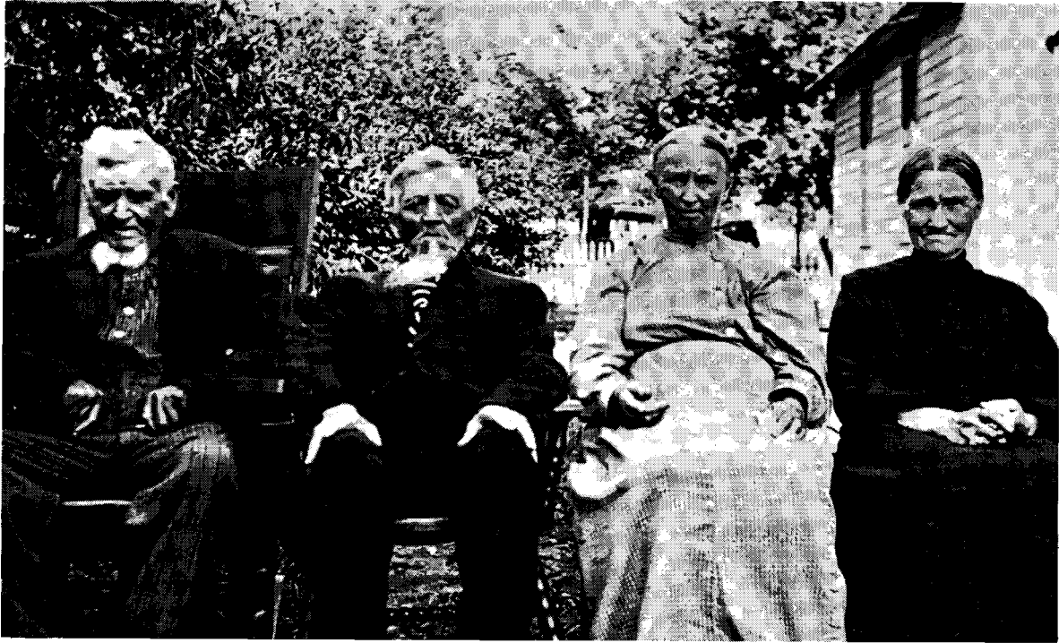
Two Holland-born couples, early settlers in the Kansas Dutch colonies. This photo was taken around 1913.