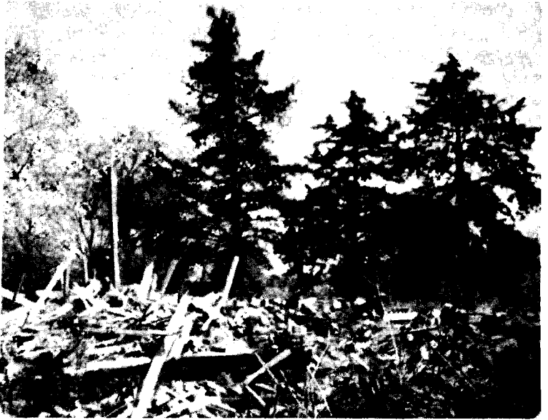
The ruins of the governor's mansion of Minneola.