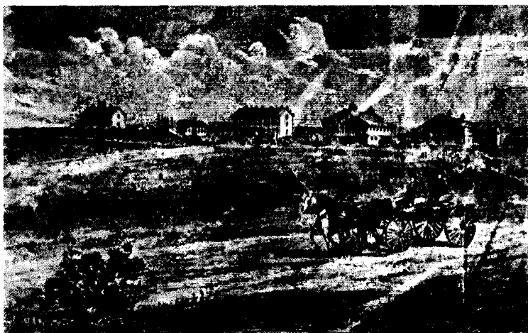
Silkville: A Kansas attempt in the history of Fourieristic utopias 1869-1892.

Because Chapman was located along the railroad, it was first established because of the attempt to find coal along the Chapman creek. It was figured that the coal could be easily transported by rail to any part of Kansas with little expense. The attempt failed because no coal was found, but the founders refused to give up. Because there was much farm ground around the area, they built a grain mill called Jackson Mill in 1868. 14 The idea seemed to work. The mill received a lot of business and the town began to grow. Other competitive businesses came into existence and traded as if Chapman was well under way to becoming prosperous. The flour and corn meal could be easily transported because the railroad was just outside of town and the need for flour was great. But this young city was about to be overrun by the two towns to its side. The mills in Abilene and Junction City started offering lower rates than the Jackson Mill could match without going bankrupt. Business began to dwindle and eventually Chapman was smothered and absorbed by its rival towns. The people moved to the two larger towns and Chapman no longer exists except for the remains of the once great Jackson Mill.