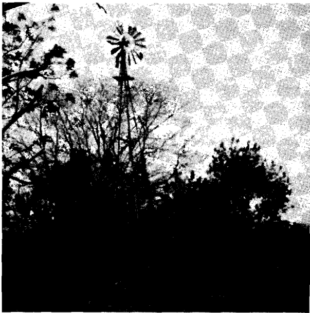
On the estate of the governor's mansion, this windmill is the only thing left standing.