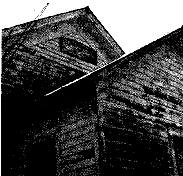
Facing the road, the sign on the Minneola school house is faded, but still legible.

a-day, Minneola, to revert to its original condition of Franklin county prairie. Below can be seen the old Minneola schoolhouse, now used by a private farmer to store his fertilizer and other equipment in.