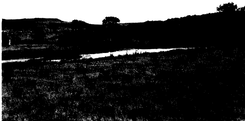
Bluff Creek, twelve miles north of Ashland, Kansas, the site where the drive ended.