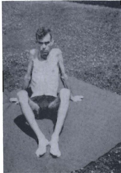
Figure 2 Minnesota “Nutrition Test” subject

Long hours and hard work constituted the norm at these institutions. Most men worked as attendants in the areas of ground maintenance and patient care. The hours averaged between 72-100 hours per week of caring for the lawn or garden, feeding patients, changing beds, and other general hospital duties. Mental ward administrators did not limit their labor force to men; women worked in the hospitals as well. Between 1943 and 1946, 300 college-age women cared for patients in a select number of state-administered psychiatric institutions. 21