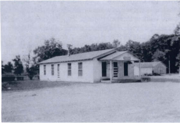
Figure 3 Soil Conservation Service office at Camp Magnolia

The work at Magnolia fell in line with the purpose of CPS's soil conservation goals. The men built waterways for irrigation, terraces, fences, cleared river bottoms, and when necessary, fought fires. The labor was intensive, but the men who grew up on farms generally did not have much trouble adjusting to it. 32