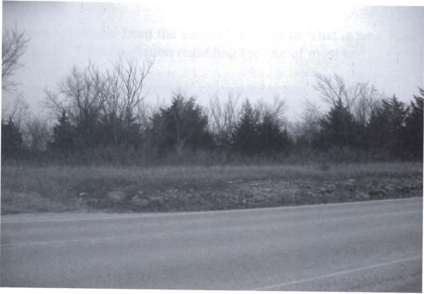
Typical outcroppings of Osage Cuesta limestone at townsite location.