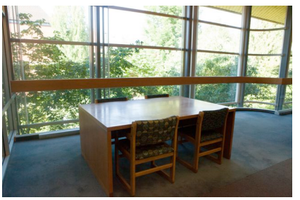
Library study space with a window view to green spaces.