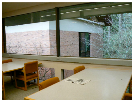
Library study space with a window view to man-made structures.