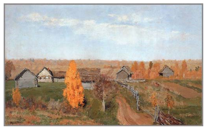
Figure 3. Isaak Levitan <u>Golden Autumn. Slobodka</u>, 1889, oil on canvas, 16.9 x 26.5 in., State Russian Museum, St. Petersburg.

hallmark of contemporary Russian painting in his art historical essay 'Zwei Jahrhunderte Russische Kunst' which appeared in the 1906-1907 issue of Zeitschrift für bildende Kunst .<sup>22</sup> Levitan's understanding of color's expressive potential was so extensive, Grabar equated it with the "mystical, enigmatic core of musical drafts" and identified his painterly success in surpassing the "poetry of the theme" for "the poetry of its own forms."<sup>23</sup> Color, in relationship to