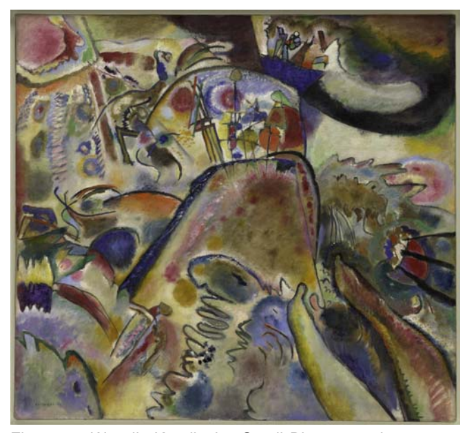
Figure 5. Wassily Kandinsky, <u>Small Pleasures</u>, June 1913, oil on canvas, 43 ¼ x 47 1/8 in. Solomon R. Guggenheim Museum, New York, Solomon R. Guggenheim Founding Collection. © 2009 Artists Rights Society (ARS), New York/ADAGP, Paris.