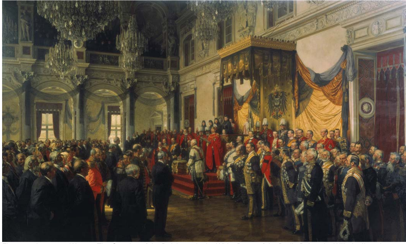
Figure 2. Anton von Werner, <u>The Opening of the Reichstag in the White Room of the Berlin Palace by Wilhelm II on June 25,</u> <u>1888</u>, 1893, oil on canvas, 12 ft. 8¾ in. x 21 ft. ¾ in., Stiftung Preußische Schlösser und Gärten Berlin-Brandenburg, Schloß Sanssouci, Potsdam.

hallmark of contemporary Russian painting in his art historical essay 'Zwei Jahrhunderte Russische Kunst' which appeared in the 1906-1907 issue of Zeitschrift für bildende Kunst .<sup>22</sup> Levitan's understanding of color's expressive potential was so extensive, Grabar equated it with the "mystical, enigmatic core of musical drafts" and identified his painterly success in surpassing the "poetry of the theme" for "the poetry of its own forms."<sup>23</sup> Color, in relationship to