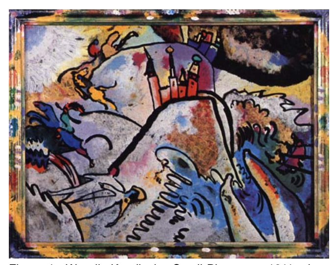
Figure 4. Wassily Kandinsky, <u>Small Pleasures</u>, 1911, glass painting, 12 1/16 x 15 7/8 in. Städtische Galerie im Lenbachhaus, Munich.

brushstrokes. Jawlensky discussed with Werefkin the importance of using line to bring out the abstracted nature of color,<sup>97</sup> and did so by varying line weight, width and paint thickness to correspond to it. Black pigment separates the principle areas of color he wants the viewer to interpret but also clarifies the distinct function each line segment has and its relationship to the larger whole. His strategy for revealing internal human states and the individual's organic emotional