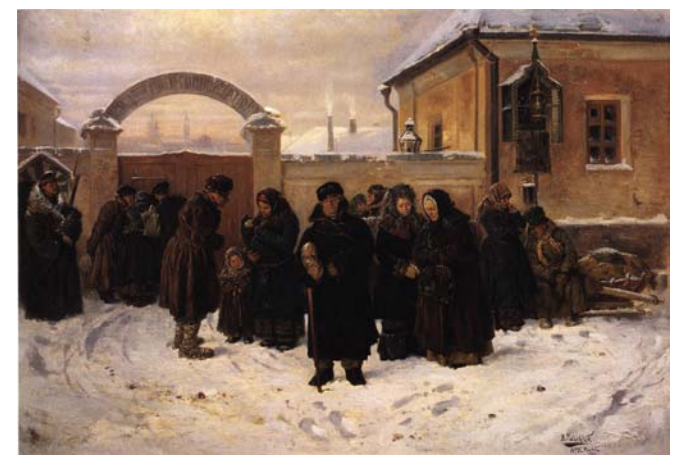
Figure 1. Vladimir Makovsky, <u>Anticipation</u>, 1875, oil on canvas, 32.7 x 48 in., State Tretyakov Gallery, Moscow.

citizens for petty offenses is presented by Makovsky as symptomatic of a broader Russian societal problem. His rendering of the Russian cross attached above the window on the right and the gilded candleholder within directly refer to the Russian church, whose credibility as an advocate for humanity has been overshadowed by its negligence of the nation's citizens. The church's interest in promoting itself as an institution of power and wealth, catering to the wishes of the rich and politically established for its own advantage, meant it could provide little spiritual sustenance to families in need, such as those before the gate.