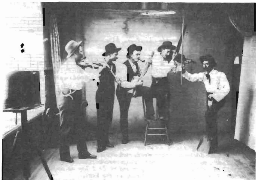
An Early Kansas Band

The most historically significant aspect of "The Old Bachelor" is that it documents the masculinity of early homesteading on the plains. A disproportionate number of homesteaders were bachelors or married men who came out ahead of their families to make a start.