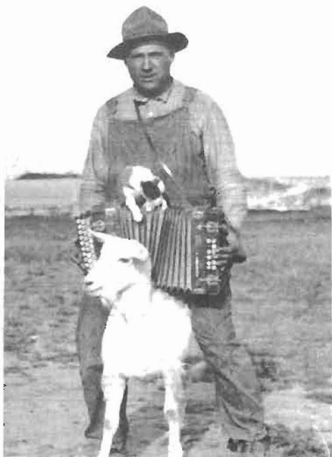
Early Kansas Musicians